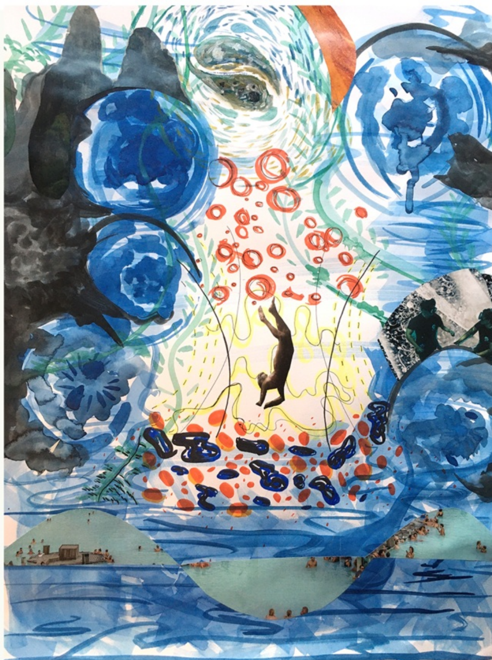
Kate Bancroft, Extension Student